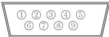
Male DSUB 9Pin (outside view)